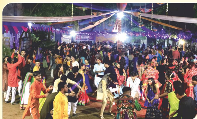
Ratri before Navratri festival organized by college.