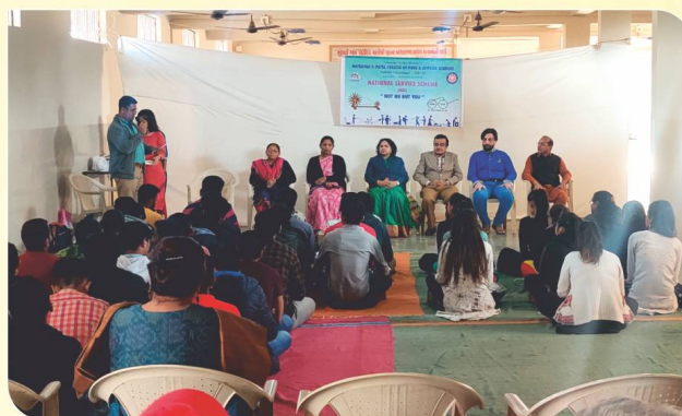
NSS annual camp at Mogri village