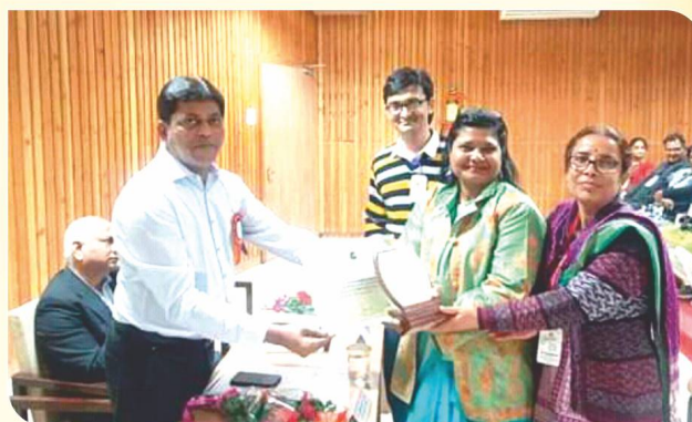
College secured A grade with 3.35 score in CVM green audit.