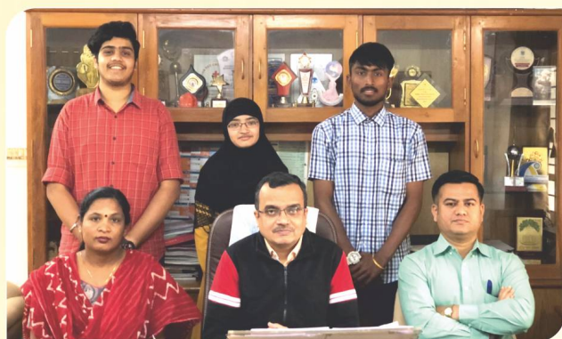
S P University Youth festival winners