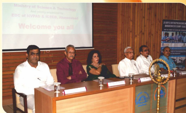
Entrepreneurship Awareness Camp (EAC)