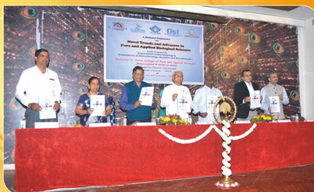
Two days National conference jointly organized by Departments of MI with BT,GT & BNF