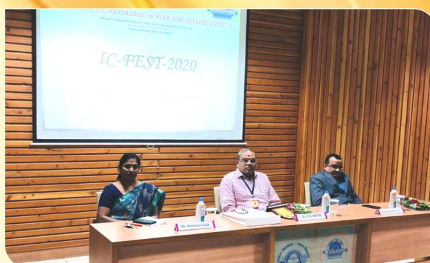
IC-Fest an Intercollegiate competition organized by Industrial Chemistry department.