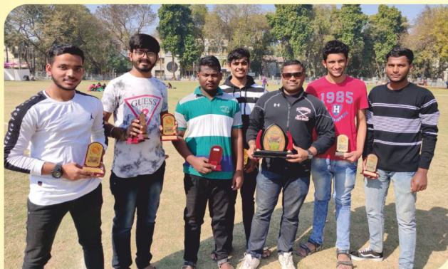
Kabbadi team secured second position in CVM Monsoon carnival