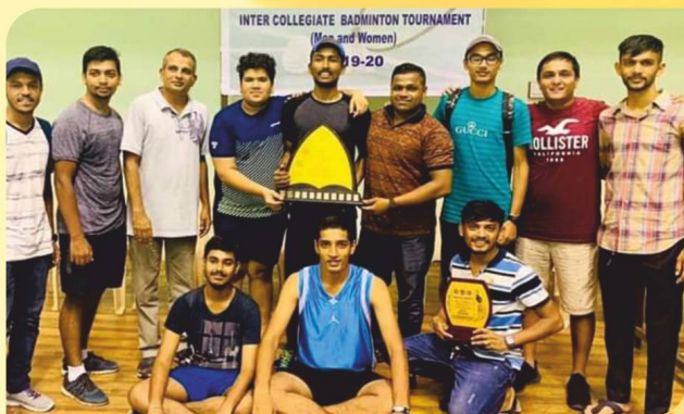
S P University champion in badminton