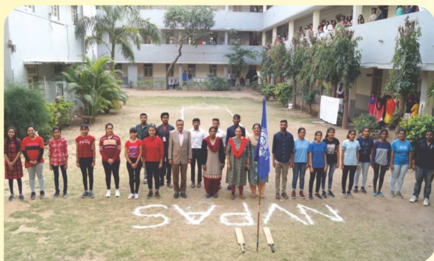
Women cricket tournament organized by Women development Cell