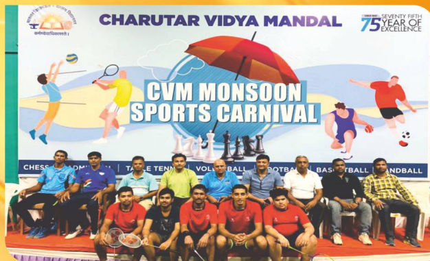
Badminton team secured second position in CVM Monsoon carnival