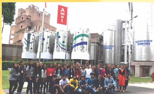
Visit to Amul Chocolate factory by TYBSc students of Microbiology