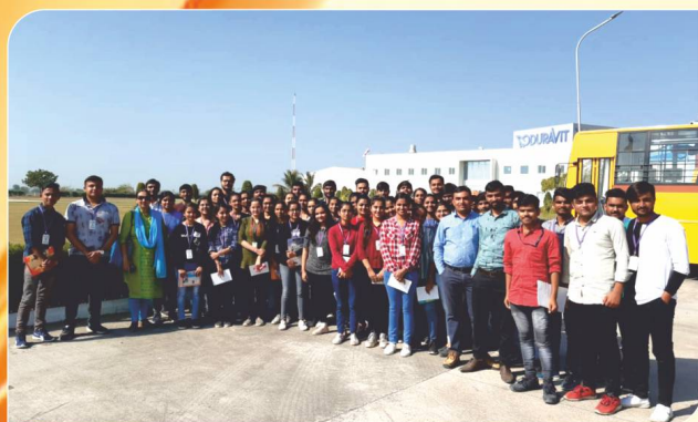
Visit to Daravut Industry by students of Chemistry.