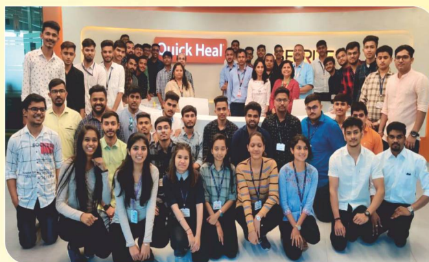
Visit to Quick Heal by students of computer science