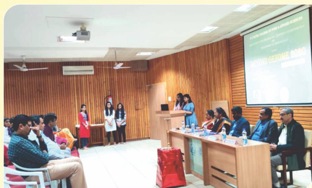
Beyond Genome-2020 an Intercollegiate competition jointly organized by department of BT,GT BNF and MI