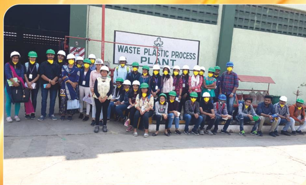
Visit to Waste plastic process by TYBSc students of ES