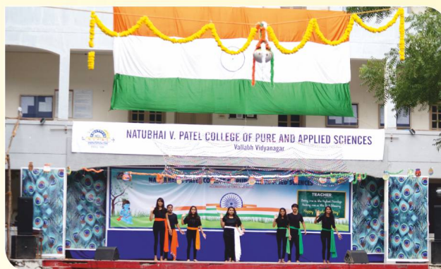
Janmasthmi / Teacher's day and Independence day organized by college