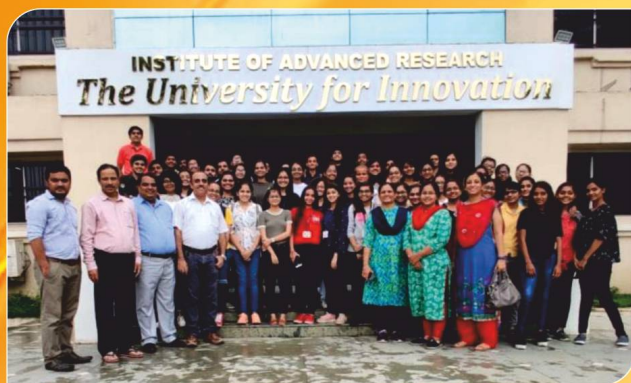
Visit to IAR, Koba by SYBSc students of BT,GT & BNF department