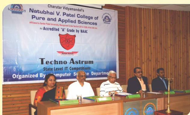
Techno Astrum -state level IT competition organized by Computer science department